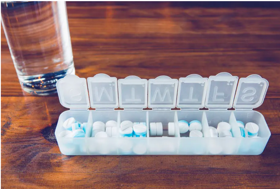
Pillbox (illustration only).

30 novembre 2017, 22:07 CET • Mis à jour le 8 janvier 2018, 16:08 CET