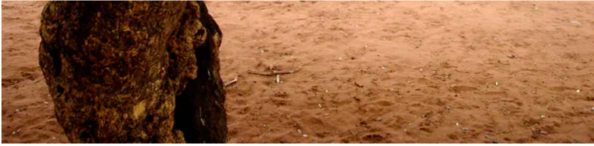
Sign in Simonga village, Zambia (2005).

The results were sufficiently encouraging that the ANRS continued with the Quatuor test. To allow a comparison, it includes a “control” group consisting of patients who continue to take their treatment seven days a week for 48 weeks. This methodology meets the requirements of health authorities for the level of evidence to accumulate before a change in prescribing recommendations.