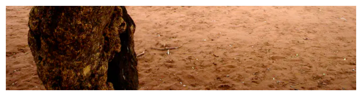
Sign in Simonga village, Zambia (2005).

The results were sufficiently encouraging that the ANRS continued with the Quatuor test. To allow a comparison, it includes a "control" group consisting of patients who continue to take their treatment seven days a week for 48 weeks. This methodology meets the requirements of health authorities for the level of evidence to accumulate before a change in prescribing recommendations.