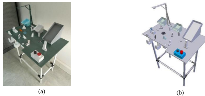
Fig. 1. The Finishing table : (a) the physical prototype and (b) its digital mock-up.

Workplaces in our partner's factory are arranged along different production lines. The workplace chosen for further study is called the Finishing table , a final assembly workplace (see Fig. 1). As it is usually being operated standing, its height can be adjusted by a wired controller, while the lifting mechanism can be interrupted by an emergency stop. The tabletop can also be inclined. The encapsulation to be assembled is made up of 5 separate pieces. During assembly, various checks and other actions have to be carried out, as indicated in the WI ( \Rightarrow not shown here for reasons of confidentiality).