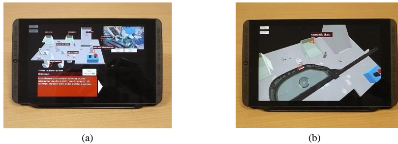
Fig. 3. Tablet prototype: (a) Initial training screen. Note the decomposition of the UI in dedicated zones for animations, videos, textual instructions, and additional images, (b) full-screen 3D view, which can be manipulated freely.

Tablet Training Application. As in the HoloLens prototype, we had to reflect the existing multi-phase training protocol. While multimodal contents are exactly the same, they are arranged differently to fit the tablet’s small display (see Fig. 3a).