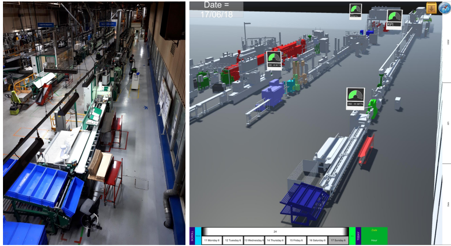
Fig. 2. 3D representation of the factory connected to KPI supervision

a priori. Evaluate solutions undertake randomized models based on statistical behavior of machines. Then the simulation result depends on some randomized values. Starting with a given state two simulation occurrences will lead to two different results. For our study a home made simulator was developed. The originality here is that the simulator has a direct access to versioned supervised data. Then the machine input models are continuously updated through the real feedback of the real world.