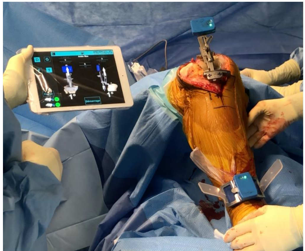
Figure 3. The accelerometer is a handheld device used within the operative field to determine the resection planes of the proximal tibia. This system guides resection angles in the coronal and sagittal planes (Perseus, Orthokey).