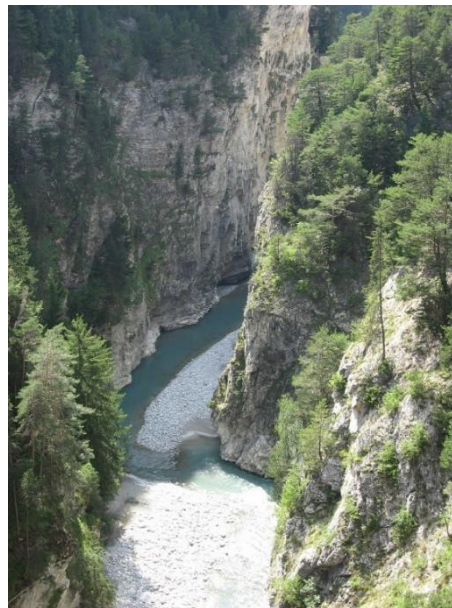
Figure 2: Arc River at Aussois.

thus strongly constrained laterally with the construction of dikes. The Upper valley remains more “natural” with less embanked reaches and several canyons (Figure 2). The river bed is made gravels but poorly sorted with presence of blocks to fine sediment deposits. The river is characterised by a system of pool and riffles where bedload transport is very active (Figure 3).