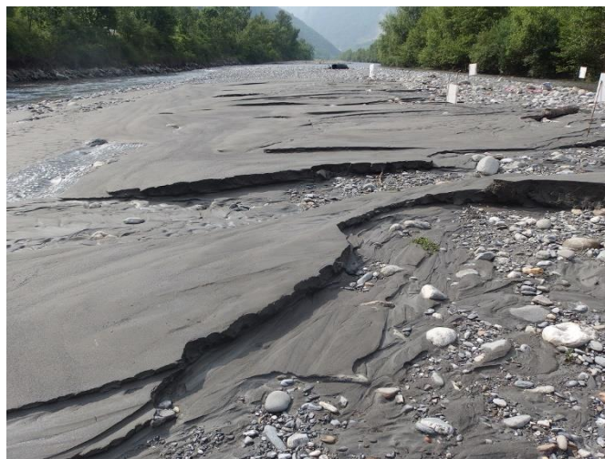
Figure 5: Large deposits observed on a gravel bar after the 2015 flushing event.

rain drops and wind may easily disperse fine sediments and enhance infiltration in the gravel matrix. Since gravel bars may contain up to 30% in mass of fine sediments (see photographs in Figure 3), this presence of fine sediments over gravel bars may impact bedload dynamics by modifying inception of transport or enhancing the bedload rate (Perret et al., 2018). Also the remobilisation of the coarse sediments during a flood would release a significant amount of fines that could settle further downstream.