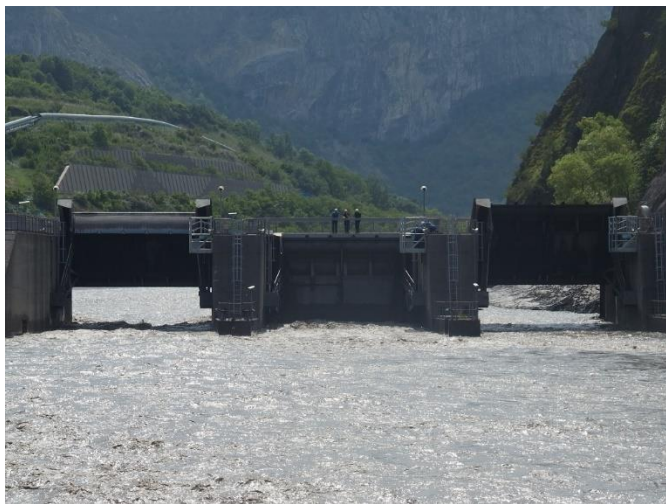
Figure 4: Saint-Martin-la-Porte dam opened during the June 2017 flushing event.

One of the main issue of the Maurienne valley is the flood risk. Due to a still significant sediment input (debris flows) and a reduced sediment transport capacity (compensation water), several reaches in the Lower Arc are aggrading. As a consequence, the flood hazard slowly increases in these sectors. At the same time, due to the large fine sediment input, the dam managers need to perform regular dam flushing to maintain their reservoir capacity, and to allow a sediment continuity. Such flushing events are operated every year except if a large flood occurred ( Erreur ! Source du renvoi introuvable. ). It consists in a general opening of the three river dams (Figure 4) together with an additional water input from high altitude reservoirs. Such events produce a relatively low (negligible) fine sediment input compared to the yearly averaged fluxes (2 to 10%, see Tab. 1). However, it may significantly interact with the river bed along the Arc and Isère rivers mainly through deposition or resuspension over gravel bars (Antoine et al., 2011).