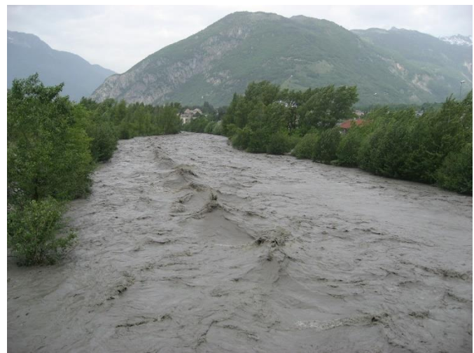
Figure 1: Arc River during the May 2008 flood at Ste-Marie-de-Cuines.

The river Arc-en-Maurienne has its source near Bonneval-sur-Arc in the Haute-Maurienne, Savoie, Auvergne-Rhône-Alpes region, France. The catchment area is 1985 km 2 with a nival hydrologic regime, the mean slope varies downstream from 6 to 0.2%. (Marnézy, 1999). The mean water discharge is strongly influenced by hydropower infrastructures built on the valley, including three river dams located in the middle of the river stretch and derivations from Arc to Isère rivers and Isère to Arc rivers. At St-Michel (upstream of main derivation), mean water discharge varies from 9-20 m 3 /s in winter to 30-80 m 3 /s in summer; summer at Pontamafrey (downstream of main derivation, it varies from 8-12 m 3 /s in winter to 20-40 m 3 /s in. The 100-year flood is estimated to be 800m 3 /s at St-Michel-de-Maurienne (≈940 km 2 ) and 930 m 3 /s at Aiguebelle (≈1950 km 2 ). Main recent floods were registered at Pontamafrey in May 2008 (Q max =480m 3 /s, Figure 1), and June 2013 (Q max =355m 3 /s).