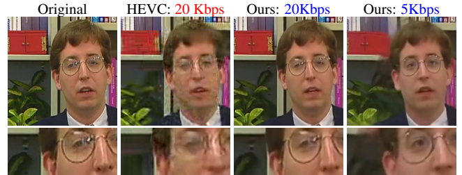
Fig. 3: Qualitative evaluation against HEVC on Deadline (Frame 40) sequence in a low bitrate setting.

ing from 5Kbps to 30Kbps. The different points in the curve are obtained by changing QP_0 in BPG, as well as \tau . We implement a simple pair comparison test interface in AMT. Users are invited to follow a brief training on a sequence not used for test. The lowest quality level (“5kbps”) is used to check the reliability of voters since 100% preference for our framework is invariably expected. We collected 30 subjective evaluations per stimulus. After collecting data from all the participants, we detected and eliminated 62 outliers. Based on these preliminary results, we proceed with an extensive performance evaluation of the proposed method using these quality metrics. In Table 2, we report the average Bjontegaard-Delta performance for VoxCeleb test and Xiph.org images. The gains are significant (over 60% BD-rate savings) on the two datasets.