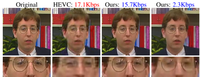
Fig. 3: Qualitative evaluation against HEVC on Deadline sequence in a low bitrate setting.

we report the Pearson Correlation Coefficient (PCC) and the Spearman Rank-Order Correlation Coefficient (SROCC) between MOS and five commonly used quality metrics, for our codec and HEVC. We observe that, except VIF, these metrics correlate well with human judgment, at least on the tested data. Based on these preliminary results, we proceed with an extensive performance evaluation of the proposed method using these quality metrics. In Table 1, we report the average Bjontegaard-Delta performance for VoxCeleb test and Xiph.org images. The gains are significant (over 80% BD-rate savings) on the two datasets.