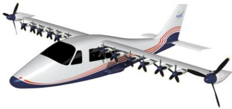
Figure 1. Illustration of the NASA X-57 Maxwell DEP concept airplane ( https://www.nasa.gov/specials/X57/ )

propulsion-airframe integration leads to a large spectrum of possible airplane configurations, enabling new capabilities and functionalities that include: lift generation and/or augmentation by blowing wings with airflow from propellers possibly resulting in a wing area optimized for cruise; improved aerodynamic efficiency from positive interaction between propulsors and wingtip vortices; optimization of structural loads distribution; exploitation of redundancies in propulsion system; use of differential thrust for control and stability in normal or degraded modes of operations; optimization of the airplane power and energy management exploiting the possibilities offered by electric motor technologies.