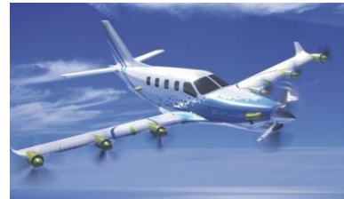
Figure 2. Illustration of the Daher - Airbus - Safran EcoPulse hybrid-electric DEP demonstrator ( https://www.daher.com )

It can thus be seen that, as compared to conventional CS-23 airplane architecture, a wide design space is available for designers through DEP with possible new ways to perform basic airplane functions. For the purpose of this study, a generic DEP architecture similar to NASA X-57, complemented with the assumption that differential thrust is used for lateral control of the aircraft in combination with traditional primary control surfaces and with an advanced flight control system, serves as a basis. This configuration is deemed representative enough to analyze novel hazards and failure conditions related to DEP.