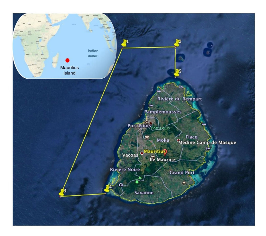
Figure 1. Location of the fieldwork area, on the west coast of Mauritius Island, Indian Ocean.

Maubydick led by the Marine Megafauna Conservation Organization (MMCO), Trou aux Biches, Mauritius Island. The study area is located on the west coast of Mauritius Island, up to 15 km off the coast between 20.465 S, 57.334 E and 19.986 S, 57.605 E (figure 1).