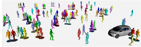
Figure 2: Snapshot of a shared space simulation

The proposed model was implemented in C++ with Pedsim_ros, and is open source and available [20]. Pedsim_ros [15] is an open source crowd simulator that integrates ROS [21], a set of software libraries and tools to develop robot applications. Pedsim_ros can be coupled very easily with robotic tools and developments by robotics specialists. In particular, the AV movements in the simulation can be controlled with ROS commands from an external algorithm, and simulated pedestrians dynamically react to the AV.