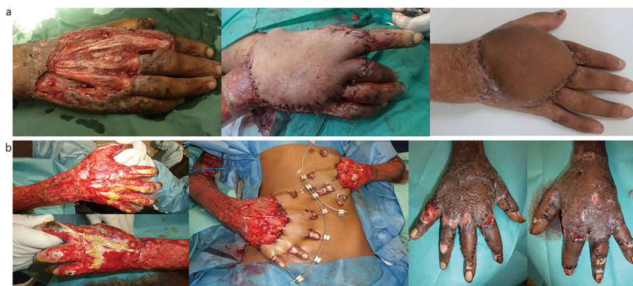
Fig. 2 Distant fasciocutaneous flap transfers to the upper limb. a Groin flap for a missile injury of the right hand: a flap repositioning was required after limited distal necrosis. b Multiple abdominal flaps for a burn injury of both hands: note the flap loss on the right 5th finger

In modern reconstructive units within well-provisioned healthcare facilities, soft tissue reconstruction is individually tailored to the wound, available and reliable flap sources, associated injuries and specific rehabilitation goals for each patient [1]. In battlefield MTF environment, however, the choices for soft tissue coverage methods are restricted. Factors that affect treatment decisions include the surgeon's expertise and available resources (e.g., surgical equipment, antibiotics, laboratory analysis facilities and the number of available beds) [4]. For these reasons, the simplest solution for coverage is always preferred [4, 6]. In our experience, pedicled flaps combined with skin grafts allowed reconstruction of almost all types soft tissue extremity injuries, even large ones. Additional skin grafts were carried out together with flap transfers in most patients but were deferred in cases at risk of early infection. Simultaneous local, or distant, pedicled flaps were used successfully in this cohort as an alternative to free transfers [4, 6]. This decision was based on our limited experience with such