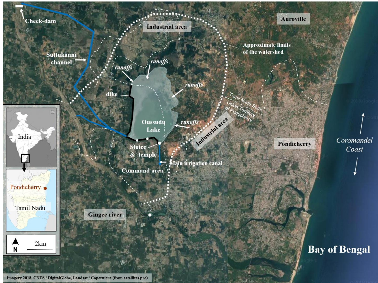
Figure 1: Location of Oussudu Lake, Pondicherry and Tamil Nadu, South India

The climate variability has a profound influence on the tank hydrology (date and time of filling, volume of water and water depths, and the date and duration of dewatering vary considerably). The tank used to collect the rains of September-December and had till recently two objectives (Perennou, 1990):