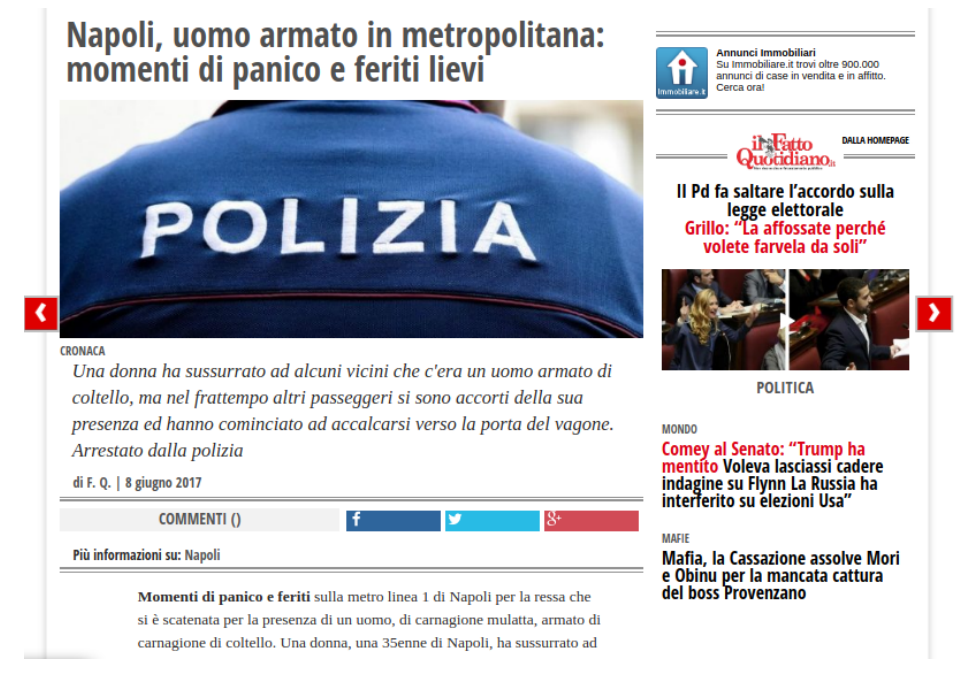
Fig. 1: A screenshot of the news story on the Naples Metro, as it was originally published on Il Fatto Quotidiano.it on 8 June 2017.

and diasporic settings, in order to shed some light on the crystallised assumptions that permit — among many other things — the publication of racially charged material disguised as journalistic coverage.