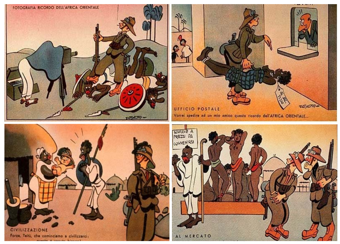
Fig. 2: Humoristic postcards by Enrico De Seta for the Italian troops in East Africa (DE SETA, 1935-36).

In the bottom left illustration of Figure 2, a Black woman shows her companion a white newborn baby, who wears a soldier/explorer helmet (the same helmet as an Italian soldier who watches the scene from afar). The African couple appears obliviously enchanted by their newborn baby. Under the title of "Civilizzazione" ["Civilisation"], a caption below the vignette reads:. "Forza, Taitú, che cominciamo a civilizzarci: questo è venuto bianco!" ["Keep it up, Taitú, for we are starting to civilise ourselves: this one came out white!"] (DE SETA, 1935-36). Here the military campaign, disguised as liberation, explicitly identifies female wombs as a territory to be occupied and utterly cleansed from their own derogatorily racialised African status.