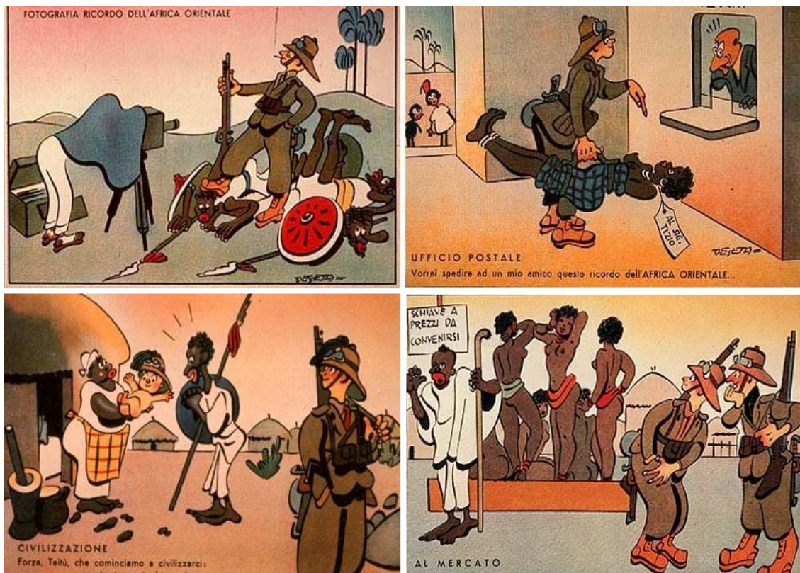
Fig. 2: Humorous postcards by Enrico De Seta for the Italian troops in East Africa (DE SETA, 1935-36).

In the bottom left illustration of Figure 2, a Black woman shows her companion a white newborn baby, who wears a soldier/explorer helmet (the same helmet as an Italian soldier who watches the scene from afar). The African couple appears obviously enchanted by their newborn baby. Under the title of “Civilizzazione” [“Civilisation”], a caption below the vignette reads: “Forza, Taitù, che cominciamo a civilizzarci: questo è venuto bianco!” [“Keep it up, Taitù, for we are starting to civilise ourselves: this one came out white!”] (DE SETA, 1935-36). Here the military campaign, disguised as liberation, explicitly identifies female wombs as a territory to be occupied and utterly cleansed from their own derogatorily racialised African status.