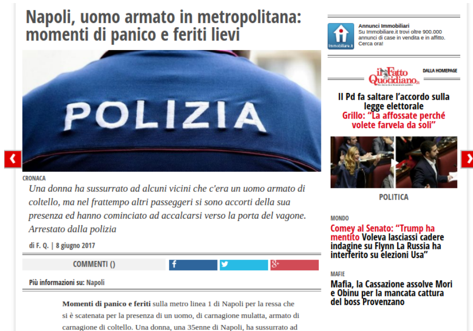
Fig. 1: A screenshot of the news story on the Naples Metro, as it was originally published on Il Fatto Quotidiano.it on 8 June 2017.

and diasporic settings, in order to shed some light on the crystallised assumptions that permit — among many other things — the publication of racially charged material disguised as journalistic coverage.