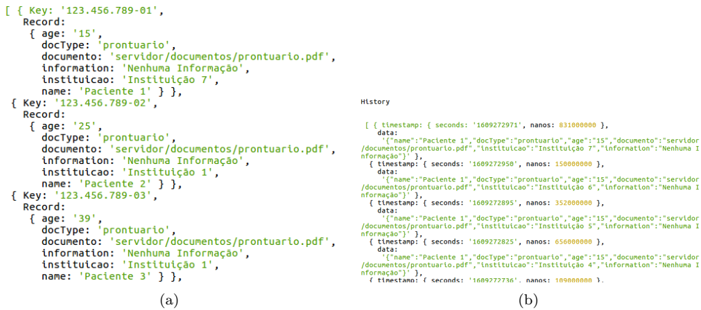
Figure 2: Data returned from the Hyperledger Fabric network

by searching for the key. In Figure 1(c), transactions with time marks are shown for the patient with ID 123.456.789-01.