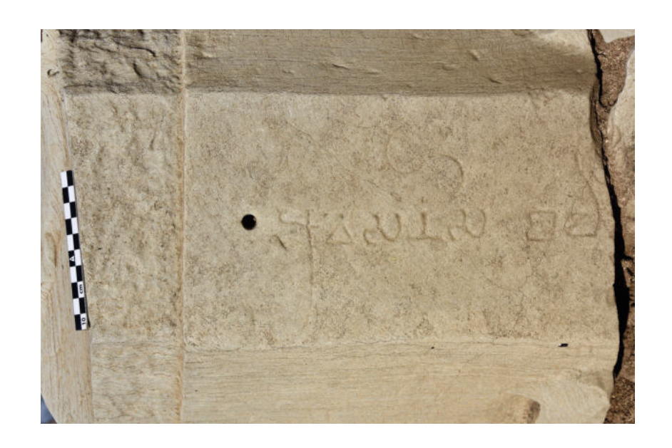
Fig. 3 Face of pillar bearing KnI II.5,11, Kanaganahalli