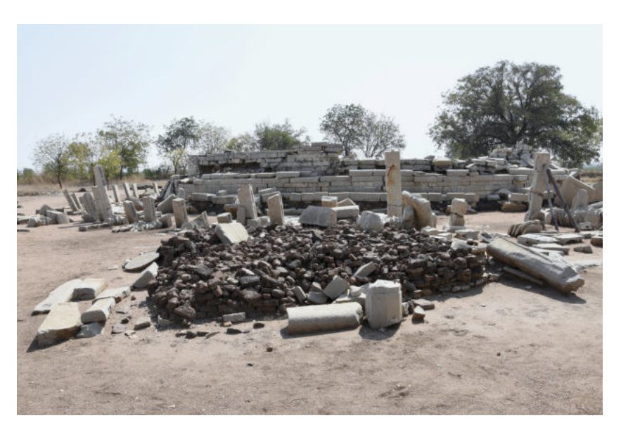
Fig. 1 General view of structure V (STR-V), to the northwest of the Kanaganahalli Great Shrine, with pillar fragment bearing KnI II.5.9 visible on the foreground