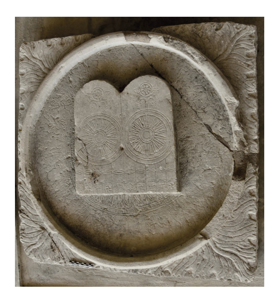
Fig. 14 Buddhapāda bearing KnI II.6,2, Kanaganahalli