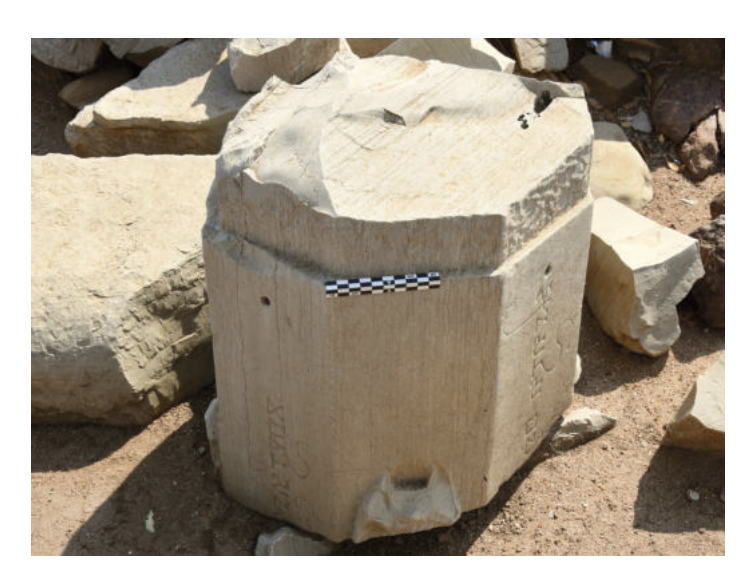
Fig. 2 Fragment of a limestone octagonal pillar (bearing KnI II.5,9 and II.5,11), west of structure V, Kanaganahalli (photo V. Tournier)