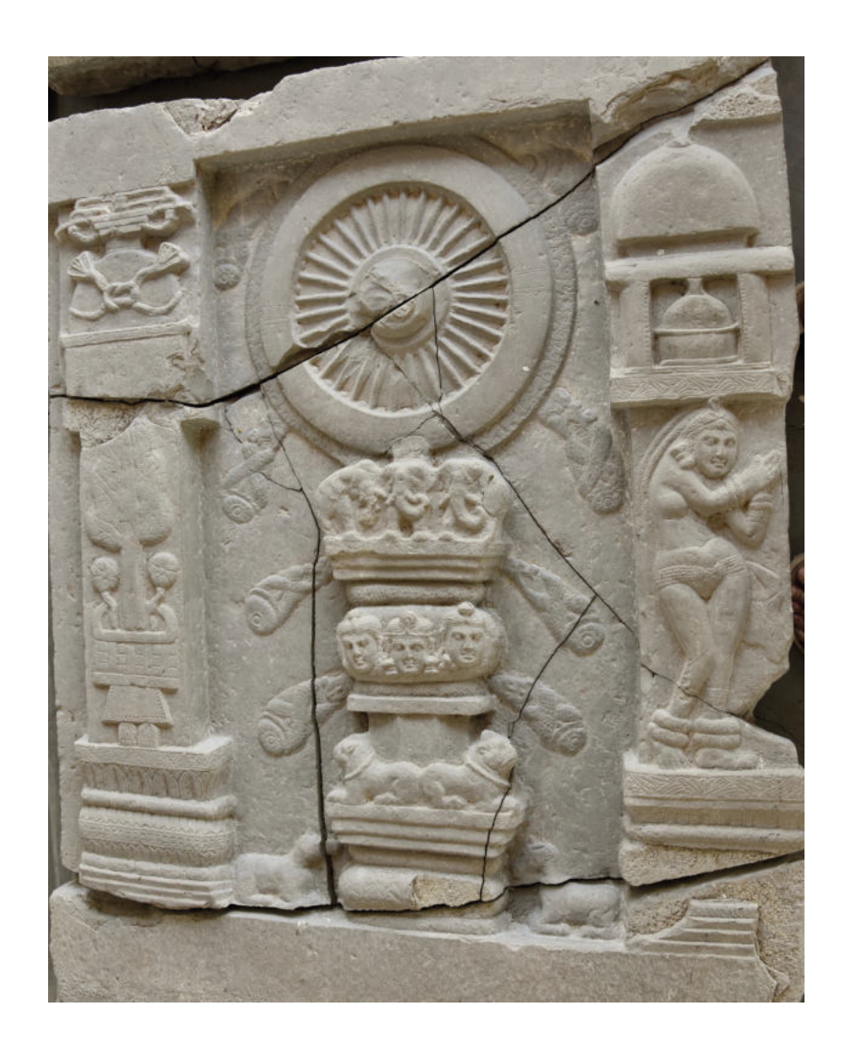
Fig. 6 Limestone drum slab, Kanaganahalli storage