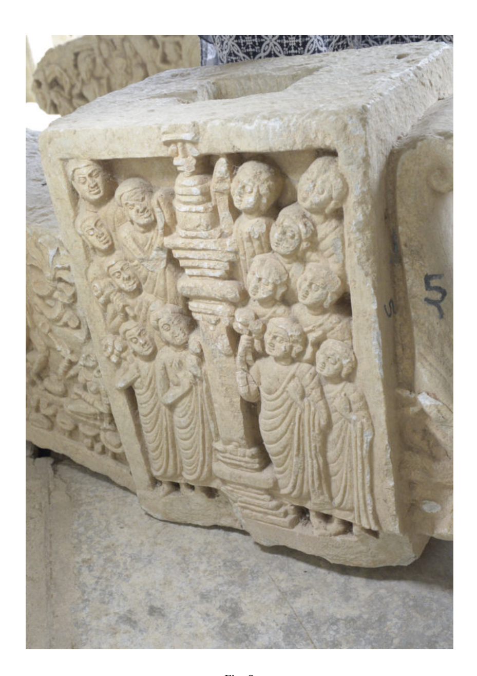
Fig. 8 Cuboid dice from the toraṇa architrave fragment 5, Phanigiri