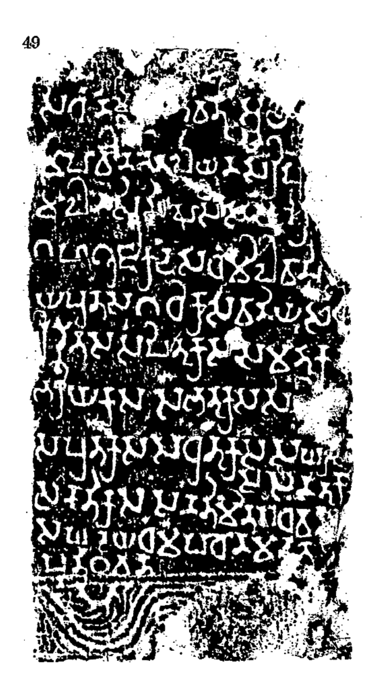
Fig. 9 Estampage of the Amaravati maṇḍapa -pillar inscription EIAD 287, after Burgess 1887: pl. LX, no. 49