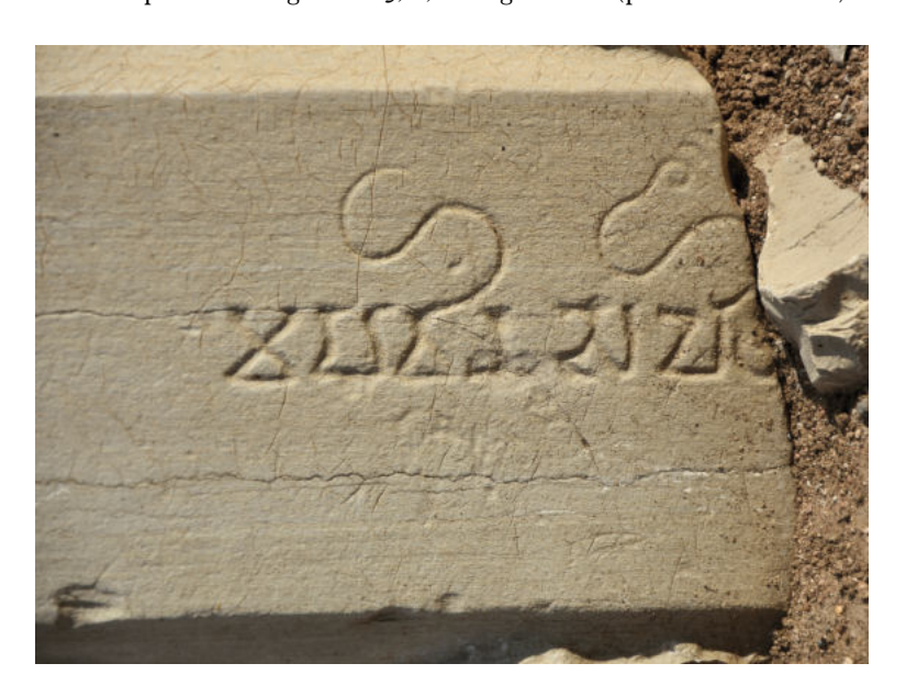
Fig. 4 Face of pillar bearing KnI II.5,9, Kanaganahalli (photo V. Tournier)