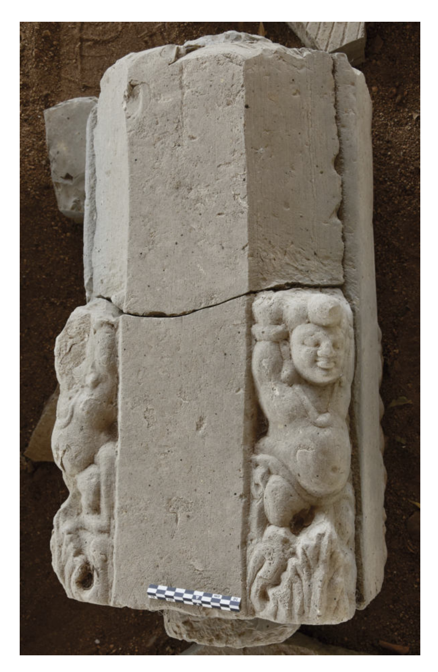
Fig. 5 Element of limestone octagonal pillar, Kanaganahalli storage