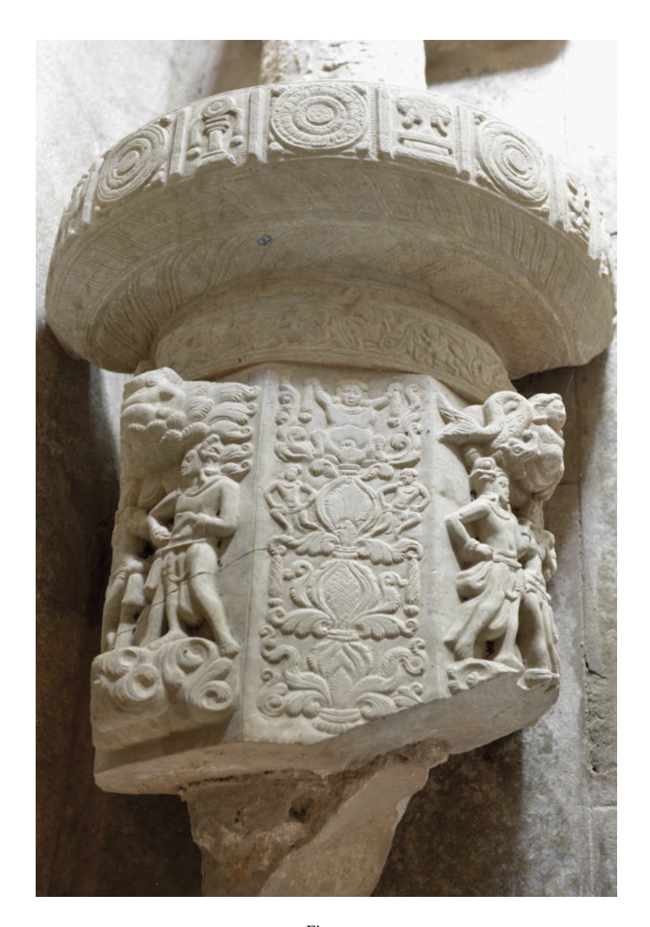
Fig. 7 Elements of a pillar capital, fragments 8–10, Phanigiri