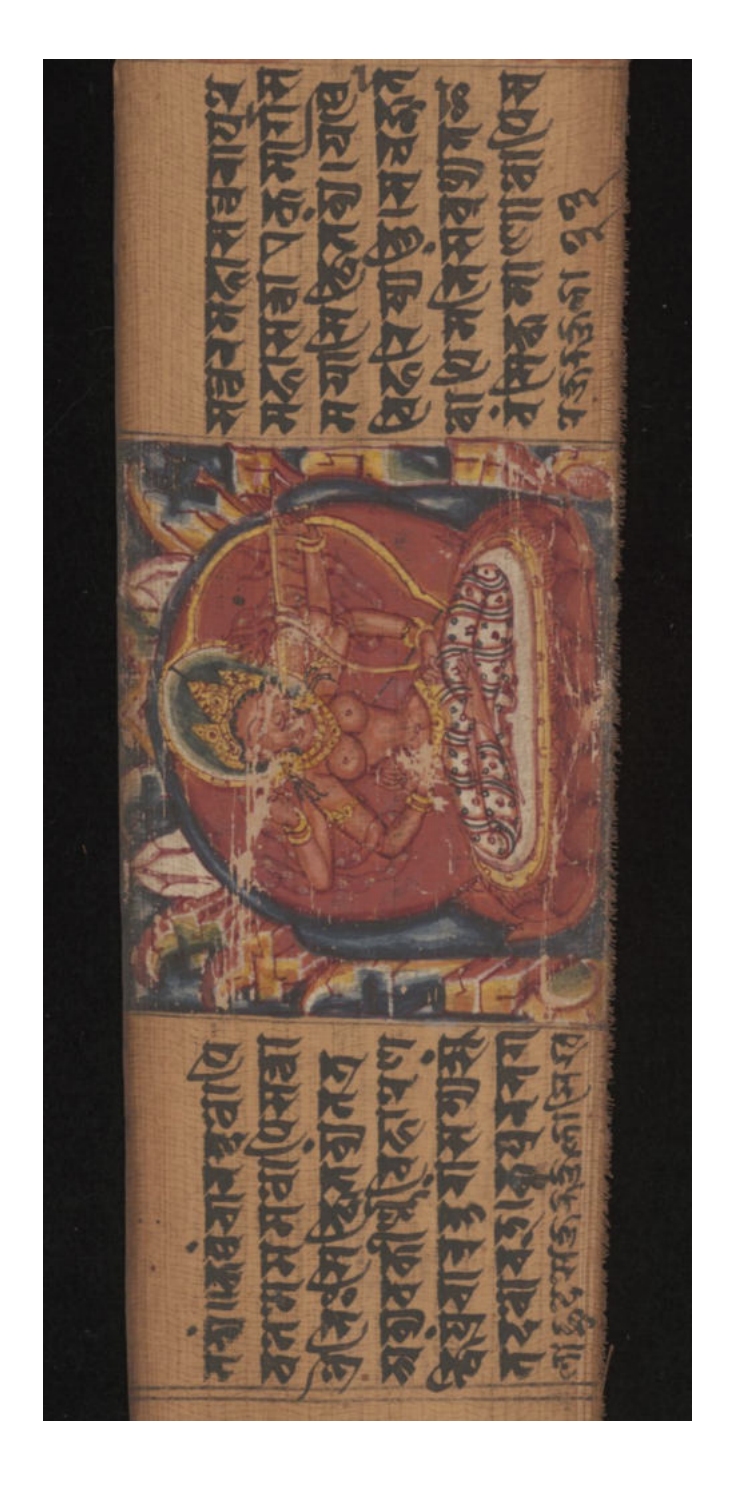
Fig. 13 Prajñāpāramitā manuscript, Cambridge University Library, Add. 1643, illustration on the left side of folio 179b