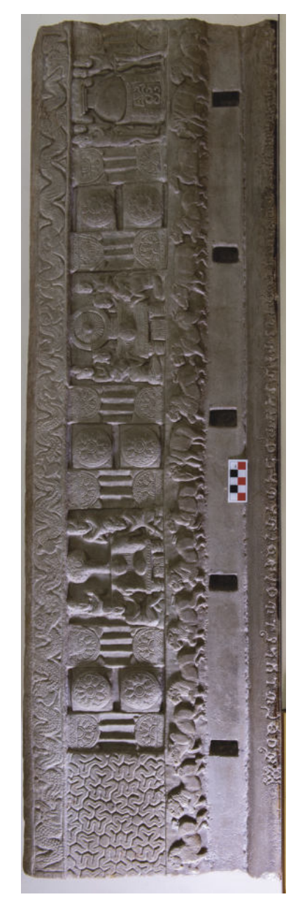
Fig. 10 \bar{A}y\bar{a}ka\text{-panel from Amaravati, bearing EIAD 537, Amaravati State Museum