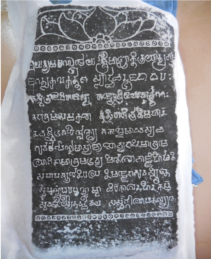
Figure 1. Photograph of August 2015 taken by Vy VAN of the estampage made by HUN Chhunteng of the stela K. 1352

Fine Art, that the stela was found in 2010 by local people at Tuol Ang Chi Chmar in Khvav Village, Champei Commune, Angkor Chey District, Kampot Province, before being taken on 24 th June 2015 to the provincial department of culture.