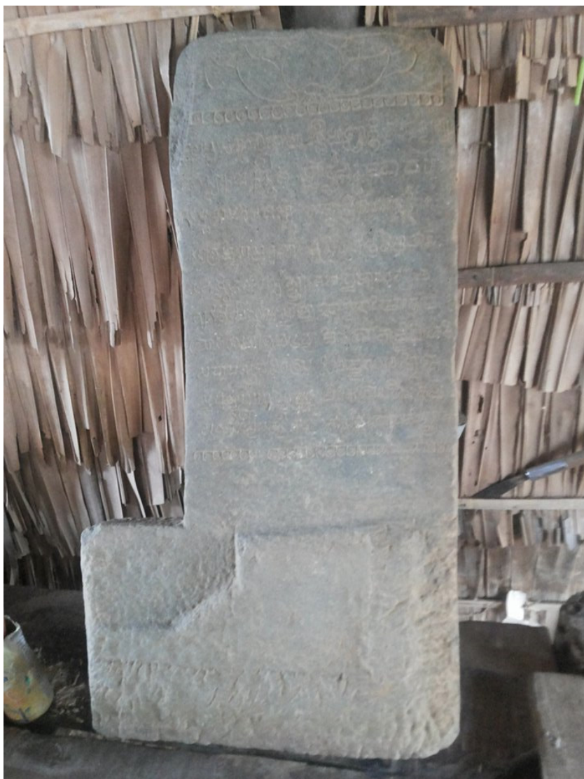
Figure 2. Photograph of June 2015

In the series of messages exchanged in June 2016, Bertrand Porte remarked that he found the stela to be of “doubtful” production (“Je la trouve de facture douteuse”), which piqued my curiosity. The shape is indeed quite irregular and rough, by the usually high standards of Khmer inscriptions. The upper part of the stone has been crudely cut to form a stela with the faintly observable