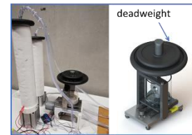
Figure 1 bio-inspired fake mouth: proposed solution

The mechanical and hydraulic system are commanded through an Arduino control card.