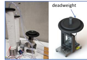
Figure 1 bio-inspired fake mouth: proposed solution

The mechanical and hydraulic system are commanded through an Arduino control card.