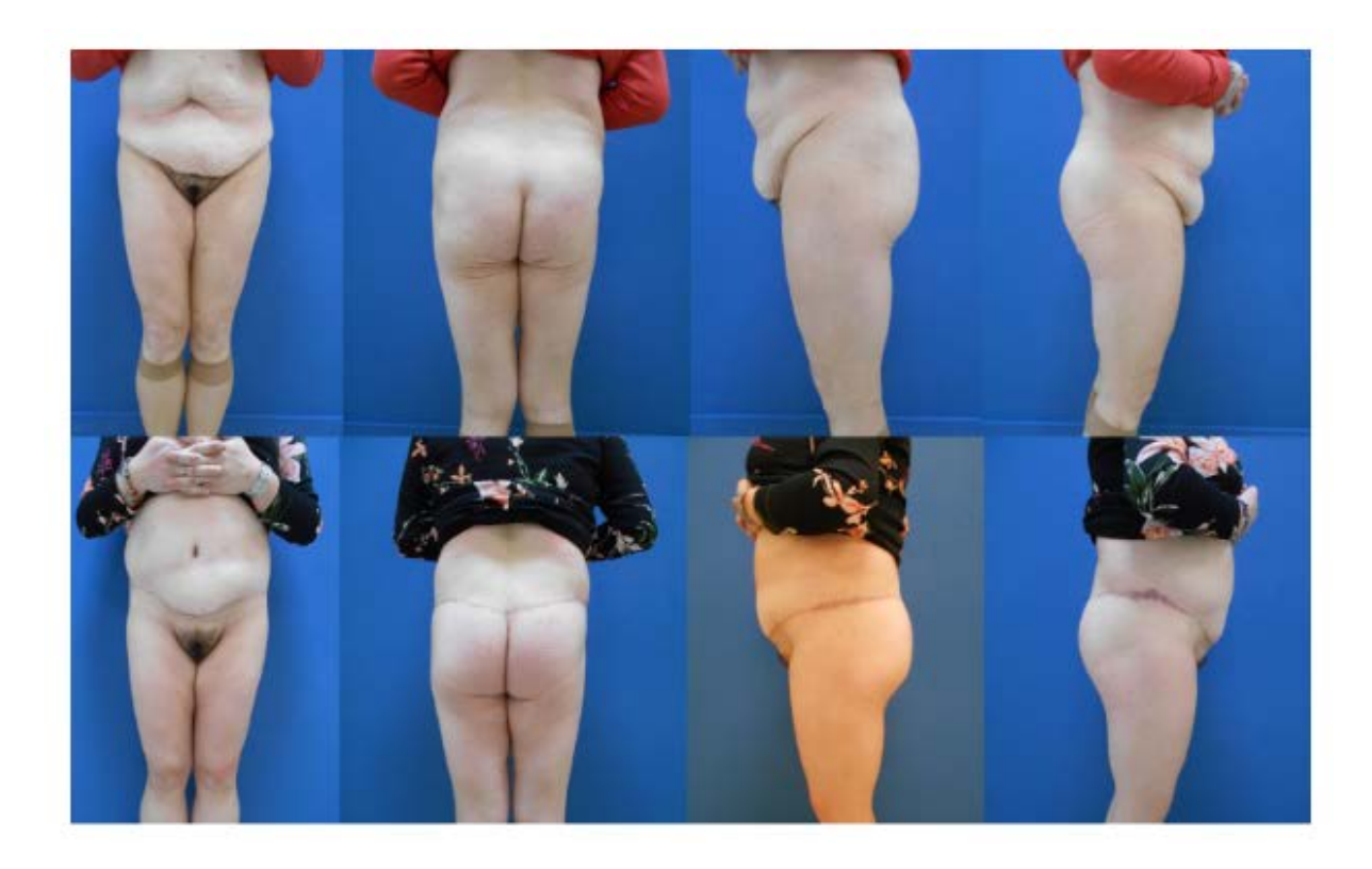
Fig. 1A Type I Lipo-Bodyliftpatient. Top: Preoperative view.Bottom: After the Lipo-Bodylift. The BMI of a 37-year-oldfemale fell from 39.7 to 25.9 kg/m2after BYPASS