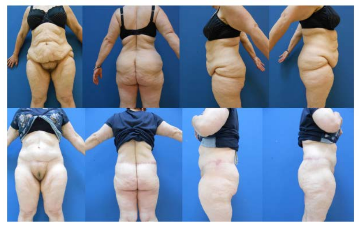
Fig. 3A Type II Lipo-Bodyliftpatient. Top: Preoperative view.Bottom: After the Lipo-Bodylift. The BMI of a 57-year-old female fell from 45.8 to 29.3kg/m2after SLEEVEgastrectomy