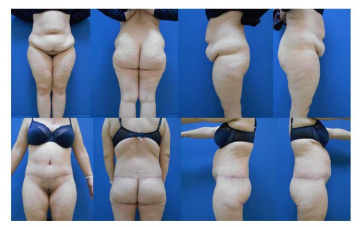
Fig. 4A Type II Lipo-Bodyliftpatient. Top: Preoperative view.Bottom: After the Lipo-Bodylift. The BMI of a 41-year-old female fell from 40.9 to 29.4kg/m2after BYPASS