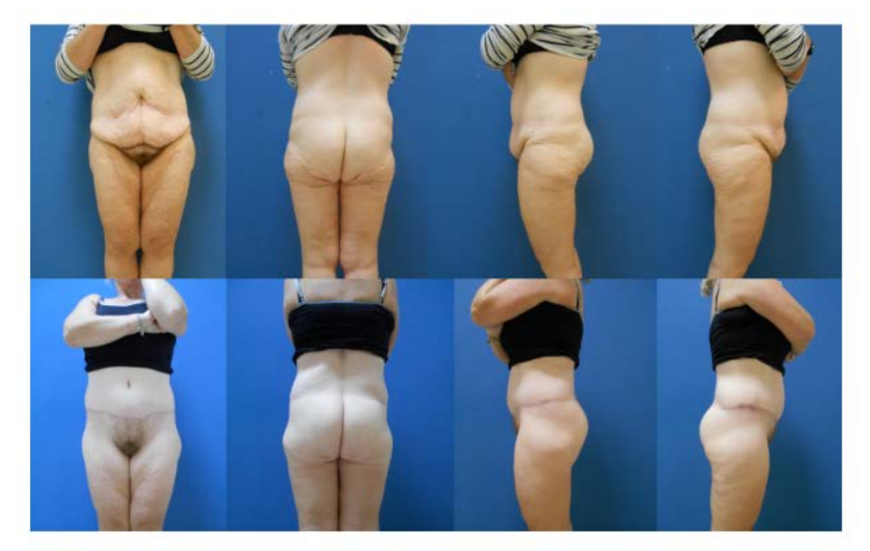
Fig. 2A Type I Lipo-Bodyliftpatient. Top: Preoperative view.Bottom: After the Lipo-Bodylift. The BMI of a 44-year-old female fell from 45.7 to 24.6kg/m2after BYPASS

Fig. 1A Type I Lipo-Bodyliftpatient. Top: Preoperative view.Bottom: After the Lipo-Bodylift. The BMI of a 37-year-oldfemale fell from 39.7 to 25.9 kg/m2after BYPASS