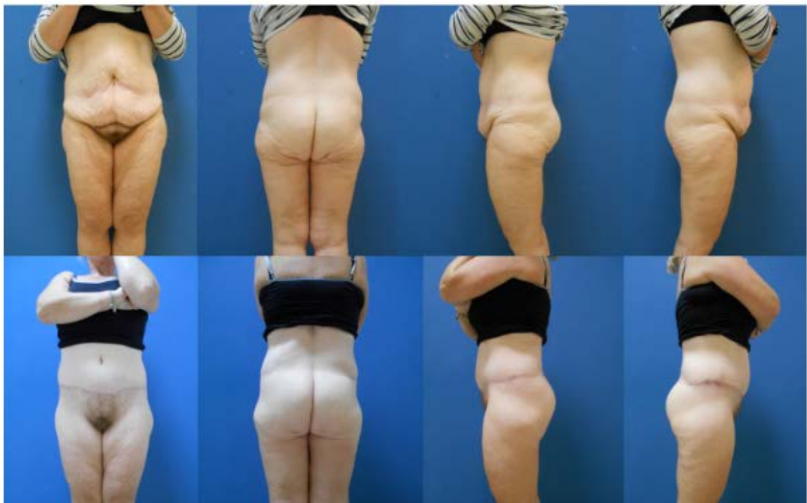
Fig. 2A Type I Lipo-Bodylift patient. Top: Preoperative view. Bottom: After the Lipo-Bodylift. The BMI of a 44-year-old female fell from 45.7 to 24.6 kg/m 2 after BYPASS