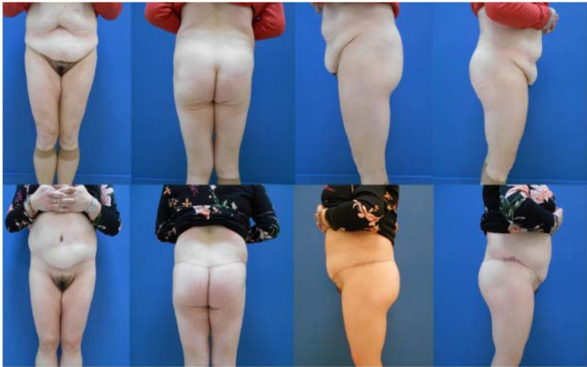
Fig. 1A Type I Lipo-Bodylift patient. Top: Preoperative view. Bottom: After the Lipo-Bodylift. The BMI of a 37-year-old female fell from 39.7 to 25.9 kg/m 2 after BYPASS