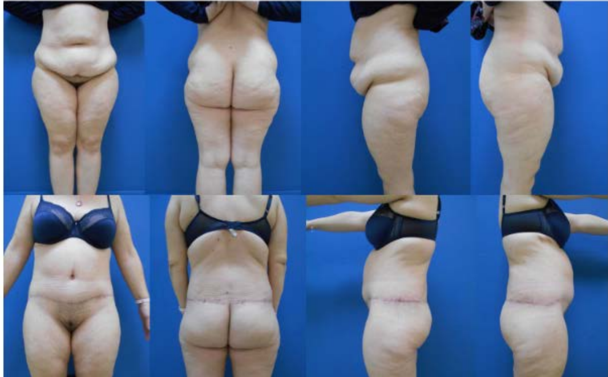
Fig. 4A Type II Lipo-Bodyliftpatient. Top: Preoperative view.Bottom: After the Lipo-Bodylift. The BMI of a 41-year-old female fell from 40.9 to 29.4kg/m 2 after BYPASS