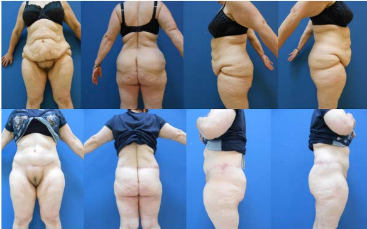
Fig. 3A Type II Lipo-Bodyliftpatient. Top: Preoperative view.Bottom: After the Lipo-Bodylift. The BMI of a 57-year-old female fell from 45.8 to 29.3kg/m 2 after SLEEVEgastrectomy