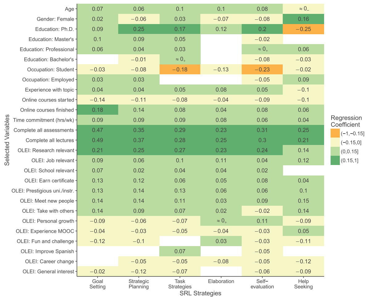
Fig. 2. Individual differences in SRL examined by demographics, prior experience, time commitment, goals and motivations (marked OLEI). Showing penalized regression coefficients for six models, one for each SRL strategy, with standardized continuous predictors (i.e., age, online courses started/finished, time commitment) and dummy-coded binary predictors (all other predictors). SRL outcome variables were also standardized for ease of interpretation. Blank boxes indicate predictor variables that were excluded by variable selection. Colors indicate the sign and magnitude of coefficients.

degree program. By comparison, the following enrollment intentions were generally associated with lower SRL skills: enrolling out of general interest, for career change, for fun and challenge, to experience a MOOC, or for personal growth.