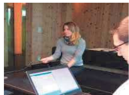
Figure 3 – User test with assistant logging tasks (right) and participant performing a task (centre)

The preferred way of logging into an account for the test participants are: password (n=5), pattern (3), PIN (2), Fingerprint (2), and Two-factor-authentication (password + token) (1).