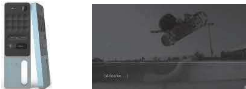
Figure 1 - On the left, remote control used during the survey, Linemote. On the right, voice search menu of our user interface, listening state.

Slight variations of these four tasks must be achieved with both approaches. For the remote interaction, the user has to press and hold the microphone button, and the voice search menu will be displayed. The TV immediately shows what was understood by the system in this menu when the user is talking (see Figure 1). For the ambient modality, a catchphrase needs to be stated to trigger the voice search menu, such as “Hey TV” or “Hey Alison”, and then the users can formulate their queries.