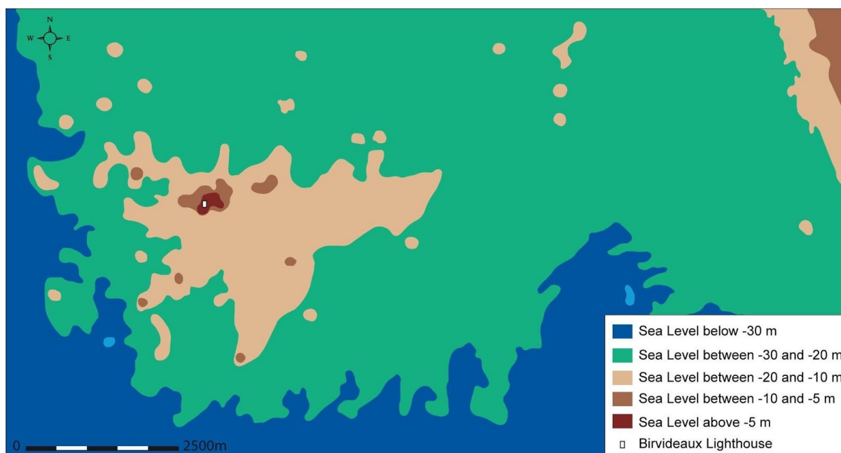
Figure 3. Cartographic evocation of Birvideaux Island based on the bathymetric curves (the zero level in France corresponds to the current lowest sea level). Birvideaux Island is only truly constituted with sea levels higher than -20 m below the current lowest seas (DAO: G. Marchand).

Les Birvideaux island space as such, only appears between the -20m and -5m levels on the bathymetric map of the Service Hydrographique et Océanographique de la Marine (levels measured in France from the lowest spring tides, see Figure 3). With the bathymetric curve at -20 m, the island measures 5 km from east to west and 3.5 km from north to south, forming an approximate surface area of 9.2 km 2 (three times larger than the current island of Houat). At the -10 m contour, the island has already shrunk away considerably, and measures 800 m by 400 m, i.e. approximately 0.3 km 2 .