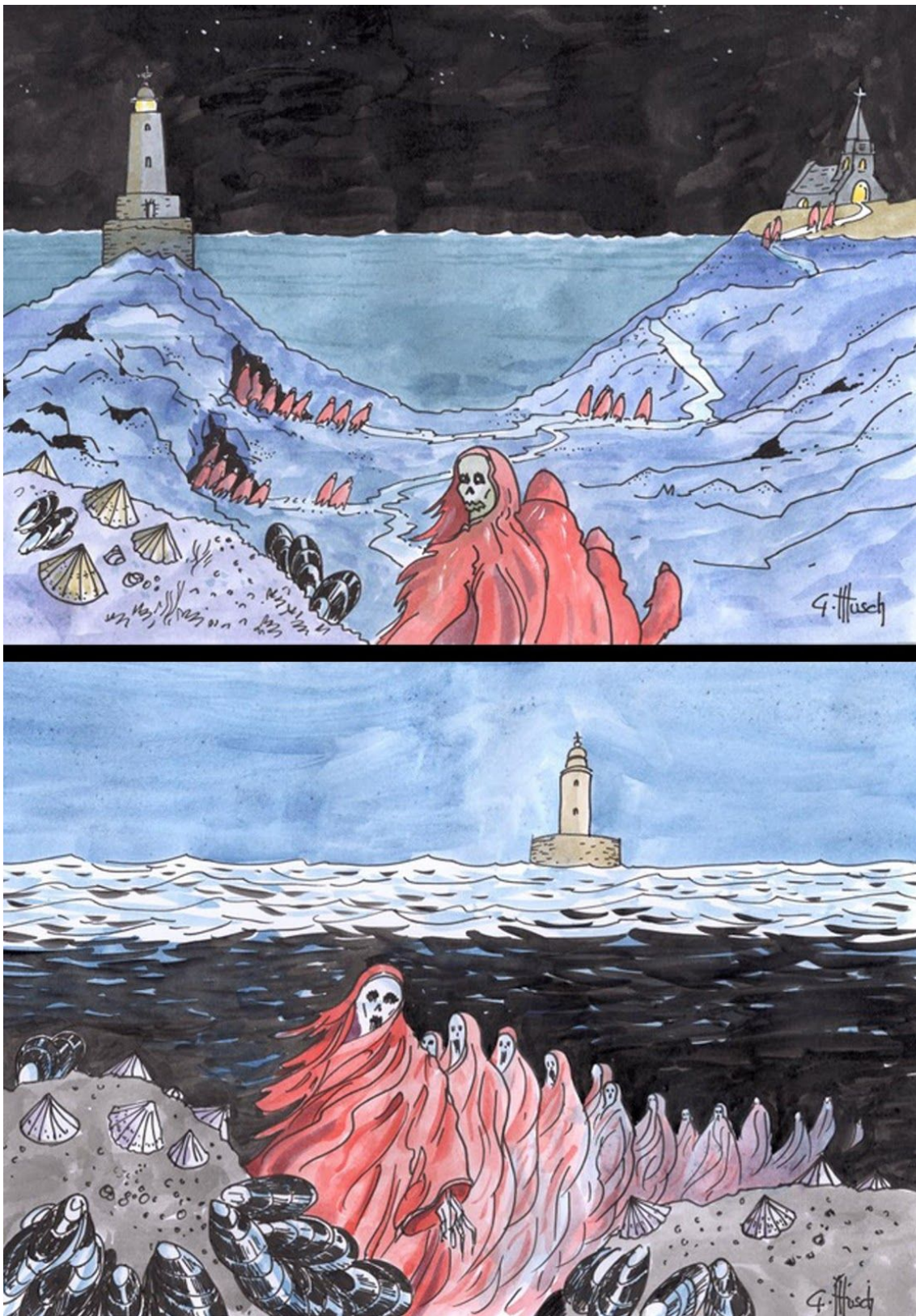
Figure 2. Evocations of the lost souls of Les Birvideaux, condemned to eat blue mussels and grey limpets (unpublished drawings by Gérald Musch, to whom I am particularly grateful).