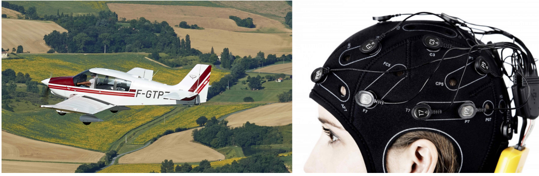
Fig. 1. Left: ISAE-SUPAERO DR400 aircraft. Right: EEG dry electrode Enobio system used for the experiment

brain response [14], [28] and to perform single trial classification [29], [30], [31], [32] in actual flight conditions. We proposed to use SRC as well as SDR techniques to predict inattentive deafness with frequency features computed over the EEG signal in a 3-second time-window preceding the onset of each auditory alarm. More conventional approaches including Nearest Neighbor (1-NN), Linear Discriminant Analysis (LDA) and shrinkage Linear Discriminant Analysis (sLDA) were also used as a benchmark.