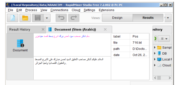
Figure 2. Sample of word Stemming.