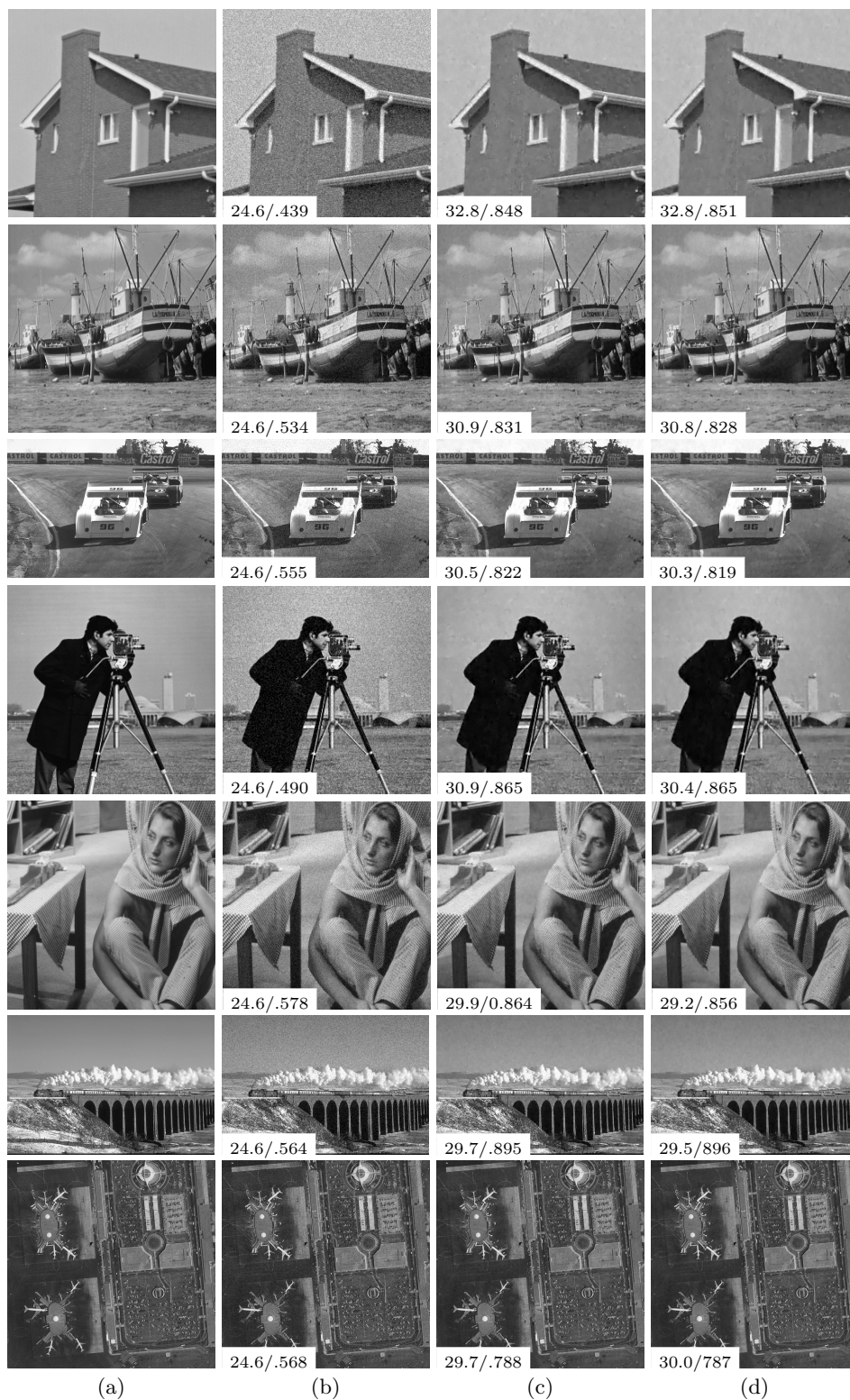
Fig. 2. Denoising results: (a) original, (b) noisy images with \sigma^2 = 15 , (c) results with truncated EM model, (d) results LR-COMP model with PSNR/SSIM. Similar denoising performances are obtained with LR-COMP with a compressed database ten times smaller