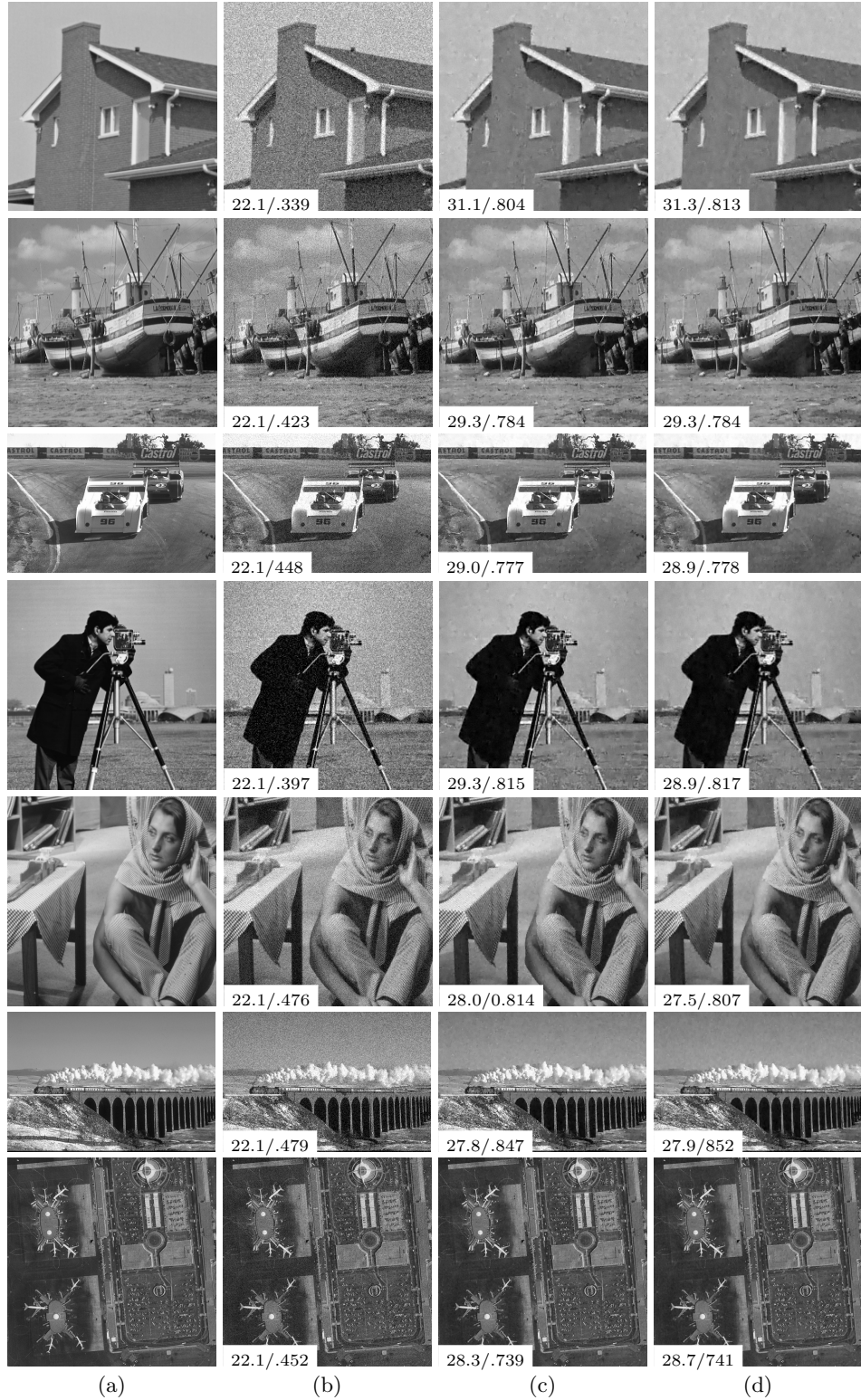
Fig. 3. Denoising results: (a) original, (b) noisy images with \sigma^2 = 20 , (c) results with truncated EM model, (d) results LR-COMP model with PSNR/SSIM. Similar denoising performances are obtained with LR-COMP with a compressed database ten times smaller.