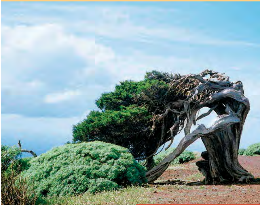
A 'rain tree' on El Hierro.