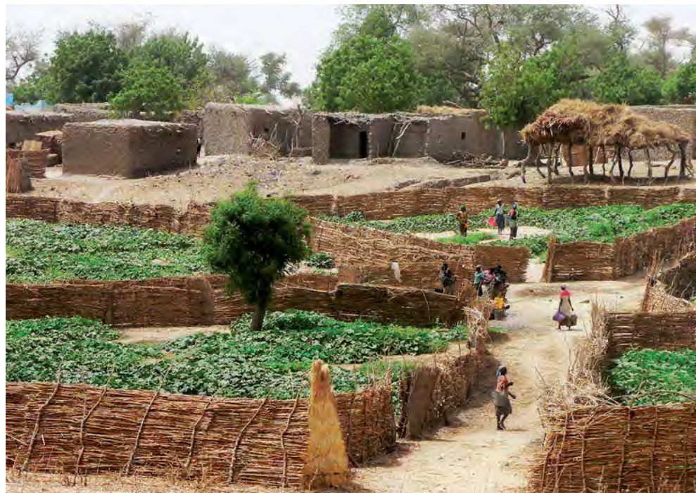
Irrigated gardens in a valley bottom in the dry season in Niger.

Perception of the climate is a key component of popular understanding of climate change. For example, farmers in the Sahel brought back practices that existed before the great droughts of 1970 to 1980, showing their observation, perception and response to the return of the rains since the end of the 1990s. Multidisciplinary scientific work seeks in particular to show all the dimensions involved in representations of changes and risks. For example, the perception of rainfall is related to water requirements and hence to farming systems, water management, etc. When the water requirements of a farming system increase, as is the case in particular of commercial soya and maize crops, the