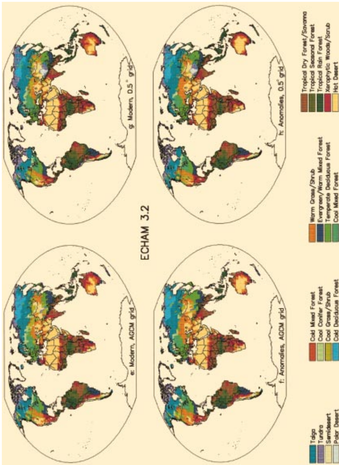
FIG. 1. (Continued)