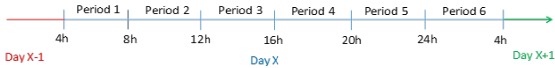
Figure 1. Periods of a workday on the planning horizon

corresponds to an integer number of periods. Any required task has to start and end within a day; inter-day tasks are not considered. Agents performing tasks of at least 8 hours can take a flexible break of 30 minutes, depending on their workload. The break time is, therefore, included in the task duration and will not be discussed further in the paper.