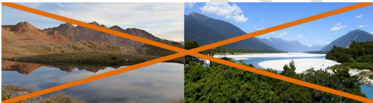
Fieldwork, environmental studies, and other such campaigns have been delayed or cancelled.