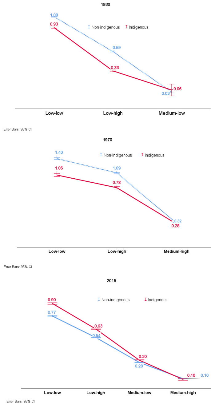
Figure 1. Number of own children under 5 per women, by socioeconomic levels Note: In 1930 and 1970 the medium-high level is not shown, because there are very few observations.