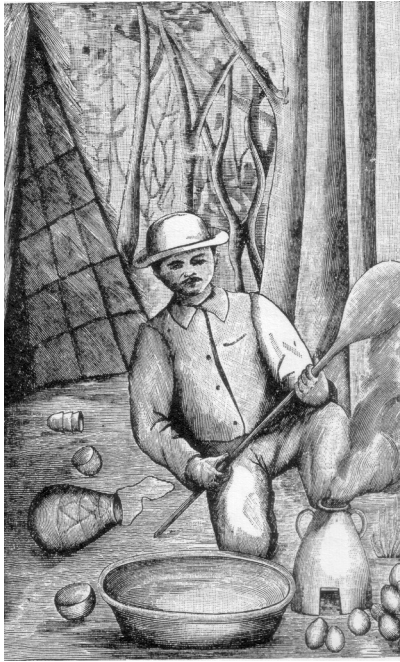
Figure 2. Smoking the rubber (drawing by Barbosa Rodrigues, [1992]1905: 39A)

the milk that was collected and the property of the burnt material in the smoke, whose gas changed the quality of the rubber (Barbosa Rodrigues, [1992]1905: 39, 40).