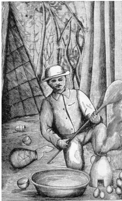
Figure 2. Smoking the rubber (drawing by Barbosa Rodrigues, [1992]1905: 39A)

the milk that was collected and the property of the burnt material in the smoke, whose gas changed the quality of the rubber (Barbosa Rodrigues, [1992]1905: 39, 40).