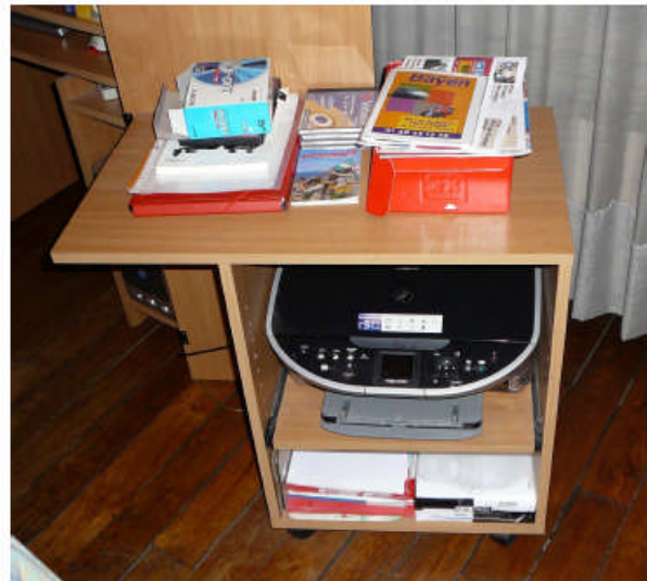
The domestic multimedia space of a teen