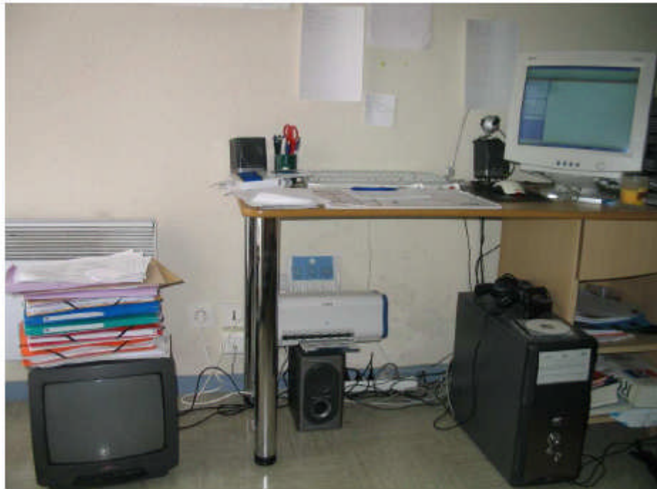
The domestic multimedia space of a nomadic 23 y.o. student (ENST Brittany)