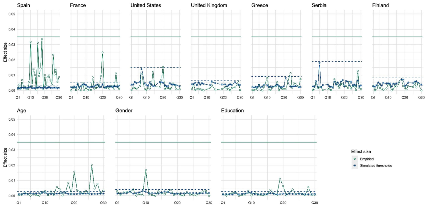
FIGURE 1 DIF effect sizes for country, age, gender, and education in the A-IADL-Q-SV. Green circles represent the empirically found \Delta R^2 effect sizes; blue asterisks represent the 99th percentile \Delta R^2 effect sizes from MC simulations. A solid green line is placed at the predetermined threshold for practically meaningful DIF ( \Delta R^2 = .035 ); a dashed blue line is placed just above the highest simulated effect size threshold. Abbreviations: A-IADL-Q, Amsterdam IADL Questionnaire; DIF, differential item functioning

score range. Conversely, MMSE scores were more strongly associated with IADL impairment in Serbia ( r = 0.56 , 95% CI = 0.32, 0.73). An overview of all correlations can be found in the Supplementary Material.