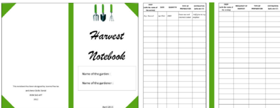
Fig. 2 Harvest Booklet: Front and Back Covers and Inside Pages (Pourias et al. 2015)

Gardeners from nine different selected allotments were followed with the harvest booklets in order to characterize their production, practices, and risk perception. Gardeners from these nine selected plots (14 individual gardeners) were individually interviewed from 2011 to 2015, and each gardener was interviewed twice during the growing season. At the beginning of the growing season, a semi-structured individual interview was held regarding his or her point of view on the importance of the food function of his or her plot (importance of the garden in the gardener’s overall food supply, use, and destination of the produce, etc.). At the end of the growing season, a second interview was held to assess the gardening practices (nature of the soil amendments and treatments such as copper foliar addition) and their level of concern about arsenic pollution. For that point, the following questions were asked: (1) Do you know the situation with water quality in the gardens? (2) Are you interested to read the study performed by the students from the University on that subject? (3) Do you have questions on that subject? (4) What is your opinion on the management of the arsenic pollution? And (5) do you want to discuss a particular point concerning your gardening activity? In addition, several meetings of the association and with the city hall helped to complete the individual analysis of how the association became more organized to deal