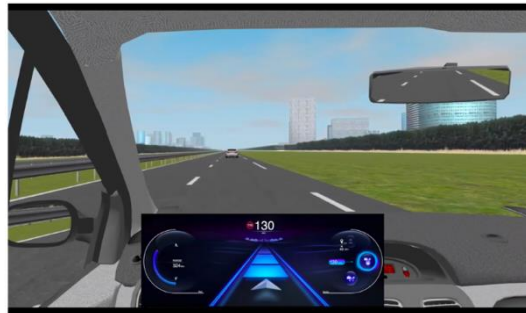
Fig. 1. Screenshot of a presented video during the experimental task for the Reference group. The road scene is represented, as well as the interface.

Videos were presented to the participants. The videos depicted four situations from the point of view of a driver of a car in a simulated environment (see Fig. 1). The situations used were reported as situations in which the system can reach its limits in the Renault Clio 5 2019 1 car user manual. They were selected depending on the conditions, assistance could stop functioning. Four situations were depicted : a road with bends , a traffic jam , a foggy area and an area where road markings were of bad quality . For each of these situations, two videos were presented: one in which the vehicle's assistance deactivated and one in which the vehicle assistance stayed active. This resulted in the presentation of 8 videos. During the road with bends videos, when assistance deactivated, the vehicle went off the road in the bend. During the traffic jam video, the vehicle of the participant braked until it reaches its maximum deceleration, then the emergency braking activated. In the foggy area videos, assistance deactivated due to too much fog density. For the road markings videos, road markings were erased, which resulted in the deactivation of assistance. In the videos, the tested interface was embedded in the cluster and zoomed so that participants could clearly see the information presented whatever the size of their computer displays (see Fig. 1). The videos stopped when the ego vehicle passed the situation or a few seconds after assistance deactivated.