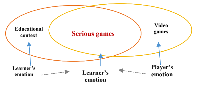
Fig. 1 Interplay between emotions, learning and playing games.

or negative. However, based on our best knowledge, there is not yet researches that discuss the issue of positive and negative emotions of the learner in SG and their relationship with learning and playing performance. From our point of view [5], in SG positive emotions are emotions that reinforce learning and improve performance during player-game interaction. Negative emotions are emotions that negatively affect learning and reduce performance during game play. The main objective of this paper is to identify learner-player's positive and negative emotion in serious games by analyzing emotions literature research in the both learning context and in the games field (see Fig 1.).