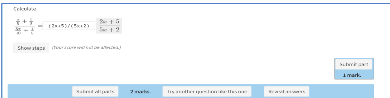
Figure 2: The student's answer is rendered immediately next to the input field

While many other mathematics assessment systems have a dependency on server-side computer algebra systems, Numbas runs entirely on the client-side, which means that the feedback is either immediate and very fast or with a small delay (Perfect, 2015). Numbas contains a computer algebra system written in JavaScript so that expressions can be interpreted and evaluated entirely on the client-side. Numbas uses a simple syntax similar to the one used on a calculator. Moreover, the student's expression is rendered in a mathematical notation beside the input field and updated immediately as the student types to make sure that Numbas has interpreted her expression as she intended (Figure 2).