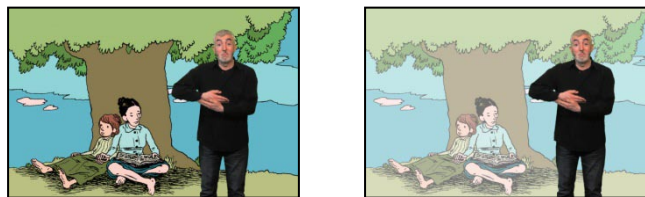
Figure 4 Actor and background integration (left) and result (right)