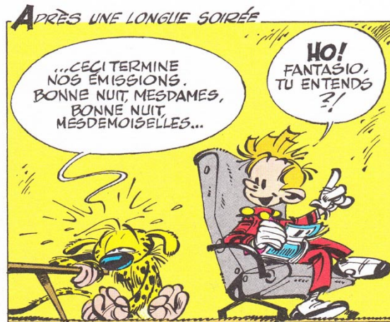
Figure 5 How to manage the appearance of a actor signing the Marsupilami (© Franquin – Dupuis) ?