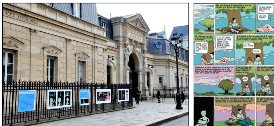
Figure 1 View of the exhibition on the fences and a page from the comic book

The recommended way to achieve that is to add a video showing a signed translation beside the original content, like for the news on TV. The use of SMIL 1.0 or 2.0 [3] is also suggested by the W3C to mix and synchronize the streams. Usually, the video showing the sign language interpreter is positioned in a corner of the screen.