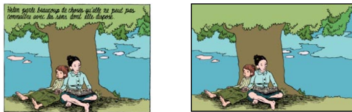
Figure 3 Original (left) and prepared (right) pictures