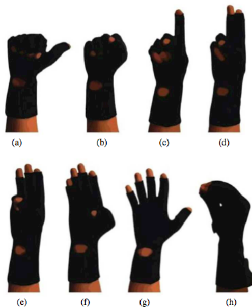
Figure 3. Glove Positions Used in the SoundGrasp System (taken from [7])

Sound Grasp is a gestural interface for the performance of live music that aims to facilitate musical control without the need for direct machine interaction [7]. Specifically, the system is designed to enable quick, performative recording and manipulation of audio samples. The interface takes the form of a wearable glove through which the user may perform one of eight gestures that are recognised by the system. These gestures are mapped to specific audio sampling processes such as record, play, reverb and, filter control.