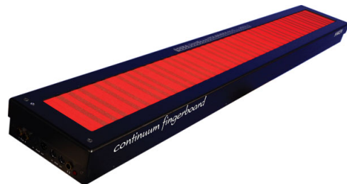
Figure 2. The Haken Continuum

The Haken Continuum (c. 1998) is a continuous surface keyboard that offers real-time control over pitch, amplitude, and timbre [4]. The Continuum features a photoelastic playing surface lit by a single-frequency polarized light source from the underside, combining the pitch sensing and polyphonic surface abilities of the Dynamic Keyboard and the Pitch Extractor.