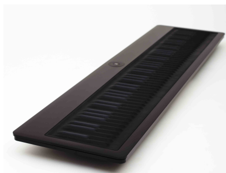
Figure 1. The Seaboard

The Seaboard is a new tangible keyboard instrument, which facilitates intuitive music creation [6]. The intent of the product design is to deliver an integrated music-creation device, which merges traditional keyboard design with modular technology. The Seaboard is the first application of the patent-pending SEA (Sensory, Elastic, Adaptive) technology.