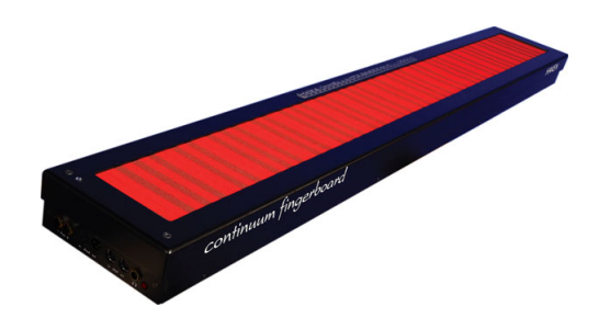
Figure 2. The Haken Continuum

The Haken Continuum (c. 1998) is a continuous surface keyboard that offers real-time control over pitch, amplitude, and timbre [4]. The Continuum features a photoelastic playing surface lit by a single-frequency polarized light source from the underside, combining the pitch sensing and polyphonic surface abilities of the Dynamic Keyboard and the Pitch Extractor.