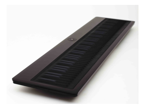
Figure 1. The Seaboard

The Seaboard is a new tangible keyboard instrument, which facilitates intuitive music creation [6]. The intent of the product design is to deliver an integrated musiccreation device, which merges traditional keyboard design with modular technology. The Seaboard is the first application of the patent-pending SEA (Sensory, Elastic, Adaptive) technology.