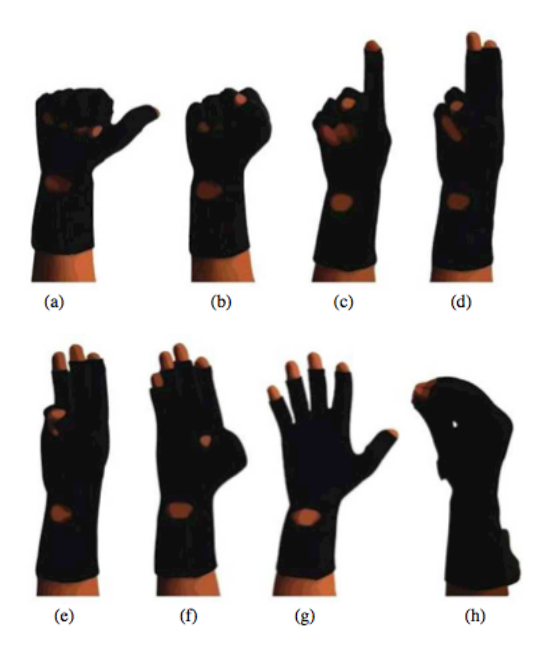
Figure 3 . Glove Positions Used in the SoundGrasp System (taken from [7])

Sound Grasp is a gestural interface for the performance of live music that aims to facilitate musical control without the need for direct machine interaction [7]. Specifically, the system is designed to enable quick, performative recording and manipulation of audio samples. The interface takes the form of a wearable glove through which the user may perform one of eight gestures that are recognised by the system. These gestures are mapped to specific audio sampling processes such as record, play, reverb and, filter control.