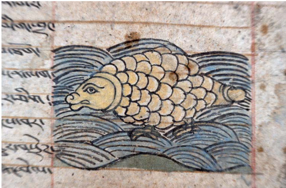
Figure 1: Fish with bird's feet. Unidentified manuscript illumination from Tabo.