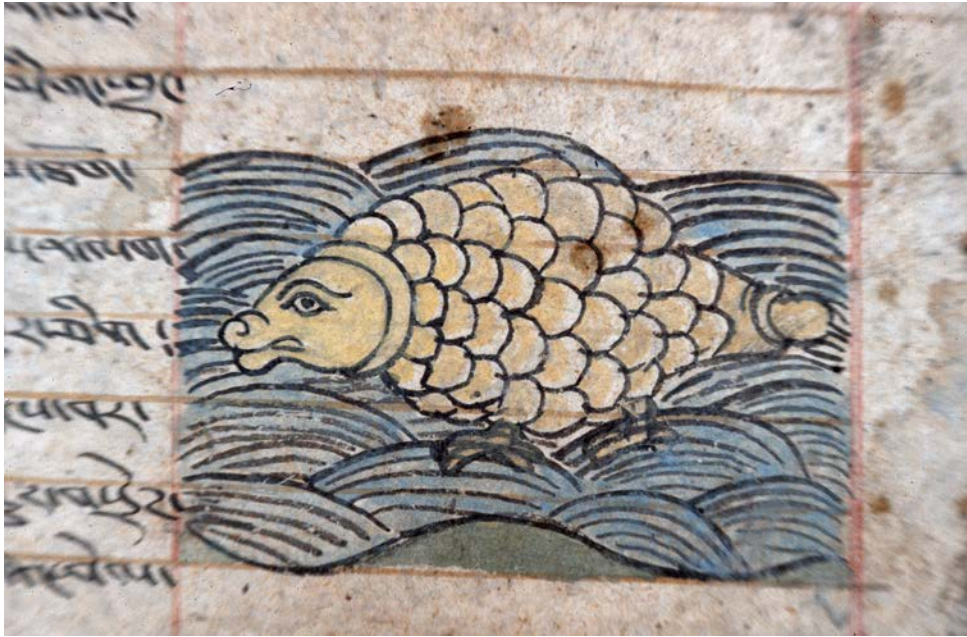
Figure 1: Fish with bird's feet. Unidentified manuscript illumination from Tabo.