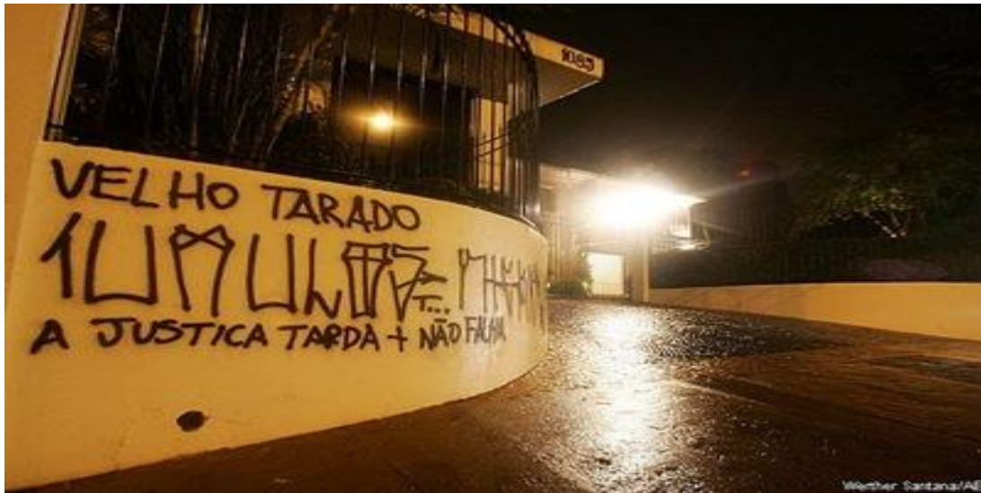
Figure 7: Pixação against the former doctor.