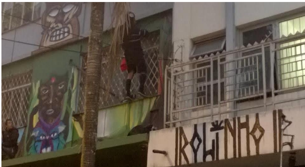
Figure 1: Pixadores in activity.

And, as pointed by Spencer et al. (2003), thematic analysis differs from coding in four ways: a) the possibility of identifying themes that emerge from the data, and no other types of codes; b) coding usually refers to the process of capturing dimensions that have already been refined (Spencer, 2003); c) this process doesn't have strict protocols; d) coding is usually associated with a realist ontology.