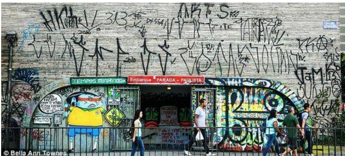
Figure 2: Style of pixação in São Paulo.

In the city of São Paulo we can see different styles of urban expression, such as tagging, bombing (more rounded and stylized letters, working shade and colours), graffiti (images containing a lot of colour and style), and grapixo (Gitahy, 1999), an intermediate point between graffiti and pixo (use of more than one colour, but in the straight style, with padding). The pixação (the verb "pixar" in Portuguese means to cover with tar or pitch), in turn, differs from these styles, since it is characterized by straight lines, confused, with sharp edges, and mostly black (spray or ink latex).