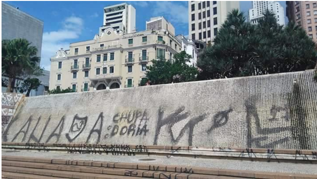
Figure 4: Protest pixação of an interviewee after Mayor Doria's actions (Canada and Kof).

city), which aims to erase and curb the pixação. In contrast, Doria intends to create a specific area only for graffiti, due to its tourist potential. The idea is the establishment of a "grafitódromo", in the mould of Wynwood Walls (Miami neighbourhood for graffiti activity).