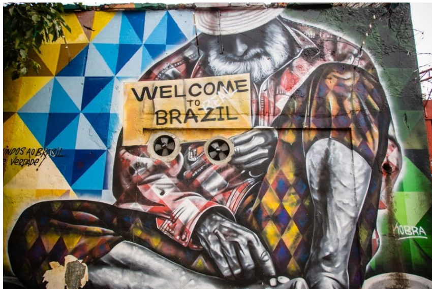
Figure 3: Graffiti in São Paulo by Eduardo Kobra.

The style is due to the dynamic of the pixação, because they work with spontaneity and ephemerality. The pixador knows that the activity is illegal and that the draw it can be erased quickly, so the time devoted to pixo is different from the time dedicated to graffiti. Graffiti is a socially legitimated activity (since 2011 when the federal law nº 12.408/2011 removed the verb “grafitar” from the environmental crimes list), and in graffiti the artist can spend much more time on his activity. The dedication of more time and the social legitimacy make graffiti more understood and accepted by society. Therefore, despite also being a form of expressiveness from peripheral areas, pixação is considered a criminal activity. In this sense, pixação is on the border between art/not art and urban expressiveness/crime.