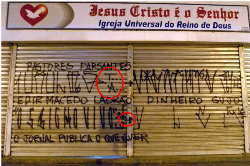
Figure 6: Pixação protest against the Universal Church of the Kingdom of God.

structure. First we look at the brand (which involves groups of pixadores), then the pixo (name of the pixadores's group), and, finally, the name or initials of who did the pixação.