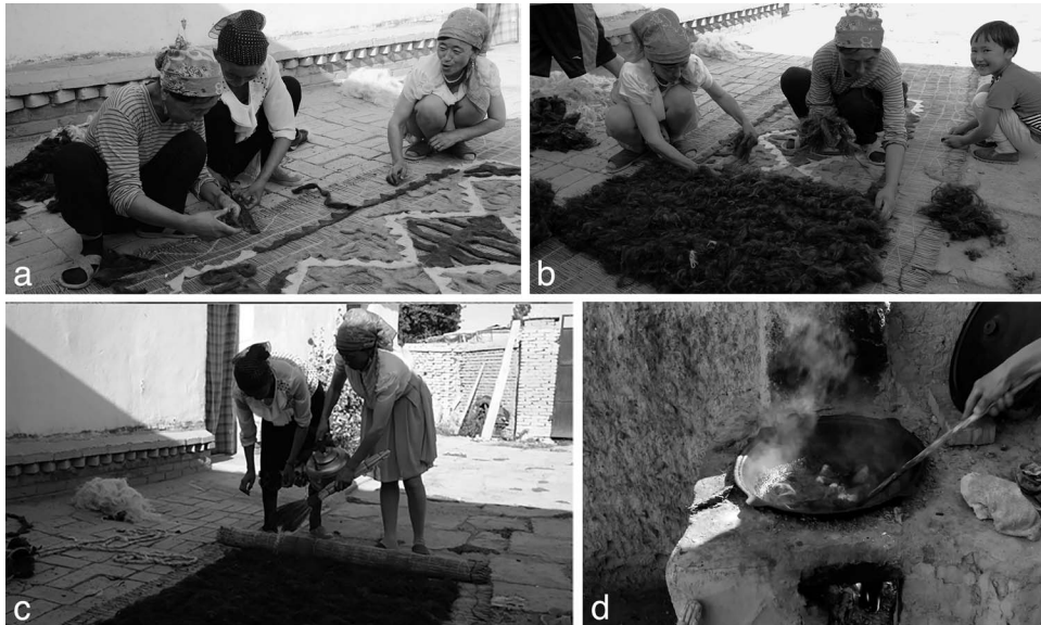
Figure 5. (clockwise from top left) a) arranging the colored patterns; b) overlaying with brown fleece as the base layer; c) sprinkling the wool with hot water; d) dyeing felt in boiling water.

between two practitioners (Figure 4b). This loosens the fibers from the staples, sheds trapped dirt particles, and filters out the matted wool, leaving the finer and longer fibers for felting (Laufer 1930:13). After 20 to 30 minutes of beating, the fleece is laid in thin overlapping patches on a handmade reed mat (Figure 5b).