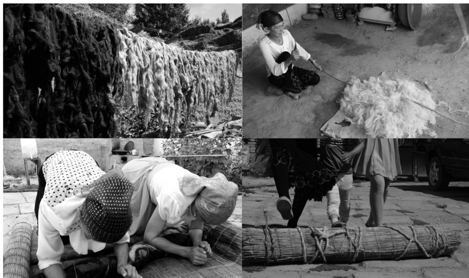
Figure 4. (clockwise from top left) a) washed wool hung to air dry; b) beating wool; c) kicking the roll to work the fleece inside into a compressed mass; d) rolling and pressing the felt roll. (Source: author's photos).

In Bortala today, the practice of felt-making remains domestic, but is becoming increasingly uncommon following the large-scale settlement of pastoralists into urban areas where felt-making outdoors becomes improbable. Making felt rugs and coverings is less essential, as pastoralists move out of their traditional yurts. Those who moved into new housing estates in Wenquan County have started using synthetic rugs for easier upkeep and a lower risk of moth infestation (Zhou 2006:88).