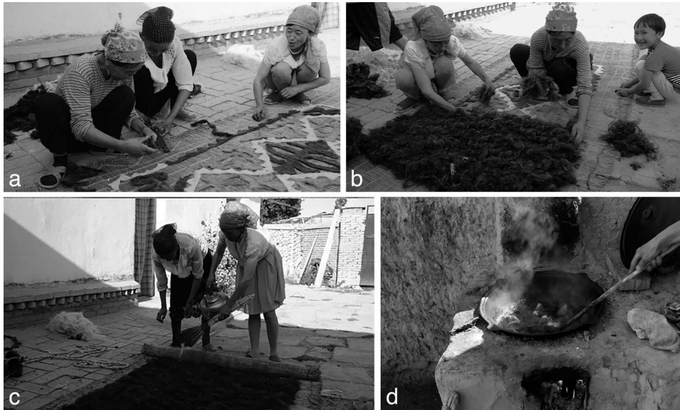
Figure 5. (clockwise from top left) a) arranging the colored patterns; b) overlaying with brown fleece as the base layer; c) sprinkling the wool with hot water; d) dyeing felt in boiling water.

between two practitioners (Figure 4b). This loosens the fibers from the staples, sheds trapped dirt particles, and filters out the matted wool, leaving the finer and longer fibers for felting (Laufer 1930:13). After 20 to 30 minutes of beating, the fleece is laid in thin overlapping patches on a handmade reed mat (Figure 5b).