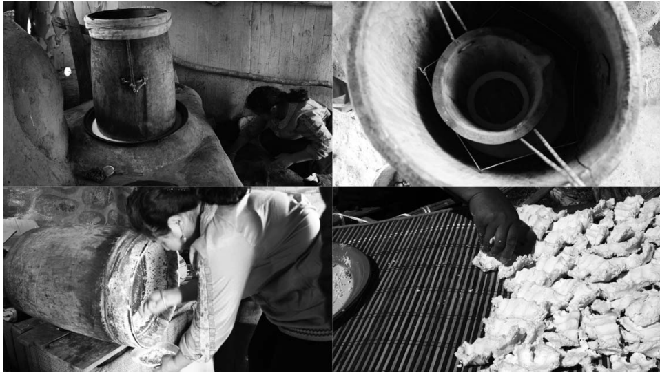
Figure 3. (Clockwise from top left) a) setup of milk distillation apparatus; b) a wooden bucket is suspended inside the barrel to collect the distilled liquid; c) soft cheese pressed into flat, crinkled shapes is air dried into hard curds; d) the residue from the barrel interior after distillation is cottage cheese.

serves as the condenser (Luo 2012:504), sits on top of the barrel. It is refilled with cold water periodically during distillation, which takes roughly an hour. A strip of fabric is wrapped tightly around the mouth of the barrel to keep it airtight.