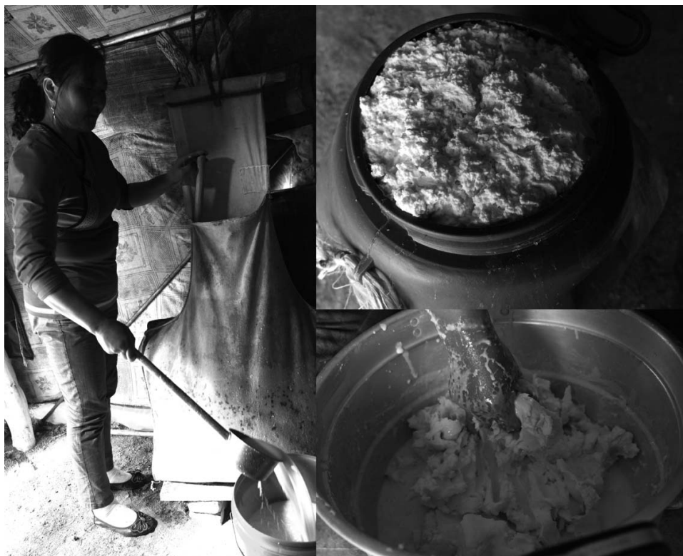
Figure 2. (Clockwise from left) a) Retrieving prepared kefir from cloth churn; b) curdled kefir for cheese-making, also used as starter culture; c) churning cream to make butter.

nutritious, they are a popular snack for long distance travels. The Kazakh milk curds are shaped as small round cakes; they have a distinctly more acidic taste than the Mongol curds.